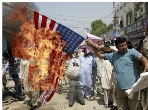
An American flag is burned in Pakistan after a US missile strike kills twelve.

This past summer the Harper government committed to a twenty-year $490 billion investment in "defence" spending. The annual military budget would increase $18 billion