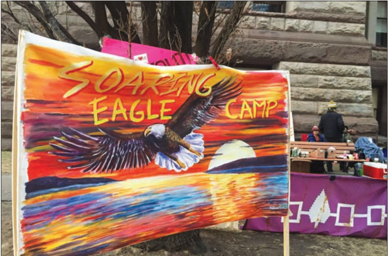
Camping for justice outside Old City Hall

Two weeks later as we’re still feeling down and talking about Colten and still doing vigils and rallies, we found out about Tina Fontaine so that was while we’re down. We got kicked while we’re down. I think particularly these two cases were so close together and I think it seemed a little silly to