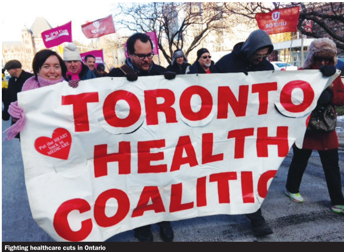
Fighting healthcare cuts in Ontario

Here I write, recovering from a double lung transplant, grateful for the amazing skills and research that has given me a new life. This is the very best that our society has to offer,