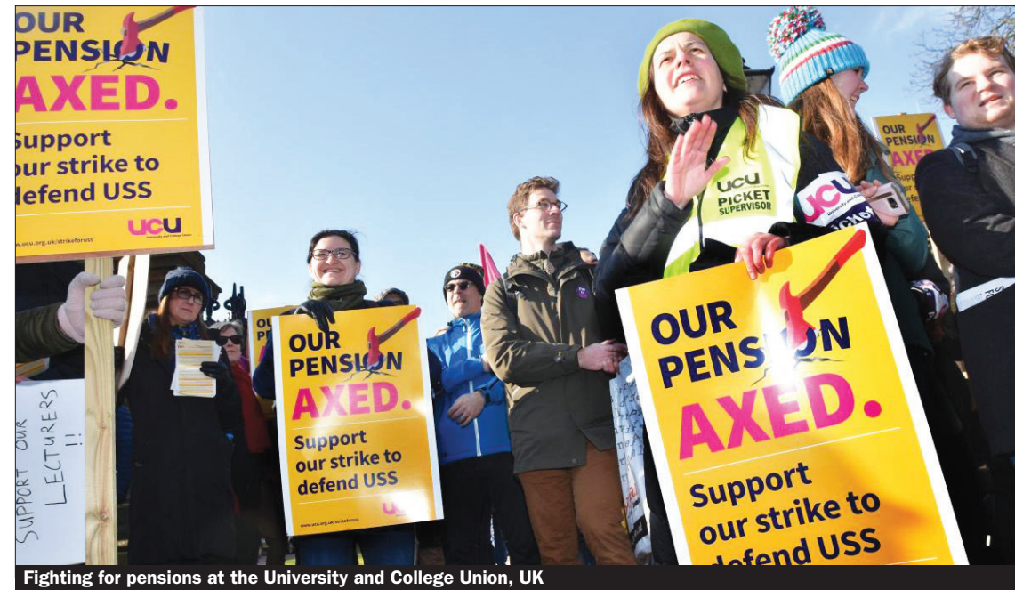
Fighting for pensions at the University and College Union, UK