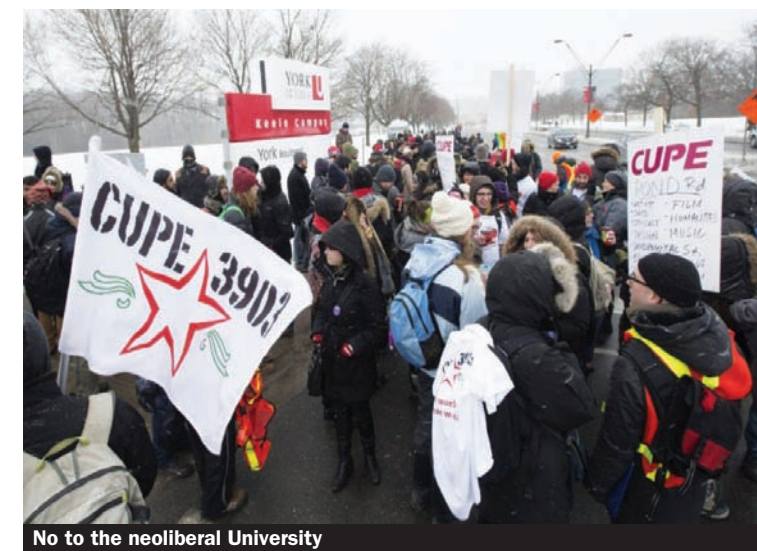
No to the neoliberal University

proposed for Unit 2 (contract faculty), who are being asked to settle for a meager two conversions per year into full-time tenure-track positions, rather than the eight conversions that were won during the 2015 strike.