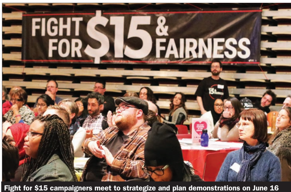
Fight for $15 campaigners meet to strategize and plan demonstrations on June 16

Precarious work disproportionately affects women and racialized workers—and it is they who are leading the fight.