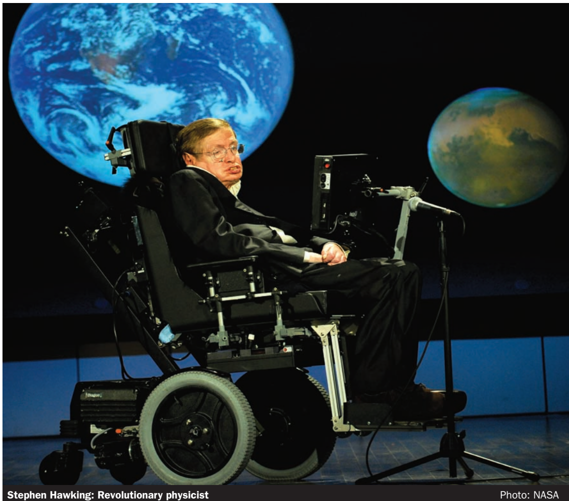
Stephen Hawking: Revolutionary physicist

Politically he was an open supporter of Jeremy Corbyn of Britain's Labor Party. He also accused Donald Trump of reckless environmental policy that was leading the world to catastrophe. We are close to the tipping point where global warming becomes irreversible. Shortly before his death Hawking said in an interview, "Trump's action could push the Earth over the brink, to become like Venus, with a temperature of 250 degrees, and raining sulphuric acid. Climate change is one of the great dangers we face, and it's one we can prevent if we act now". He has also remarked that we should fear capitalism, and that as technology improves we should instead focus on providing everyone with a living wage.