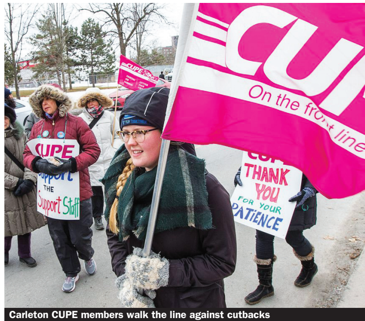
Carleton CUPE members walk the line against cutbacks

expressions of support both on campus and beyond, including from the Carleton Graduate Students’ Association, the Carleton University Academic Staff Association, the Ottawa and District Labour Council, the Ontario Confederation of Faculty Associations, the Canadian Federation of Students and CUPE 4600 — the union that represents teaching assistants, research assistants and contract instructors at Carleton.