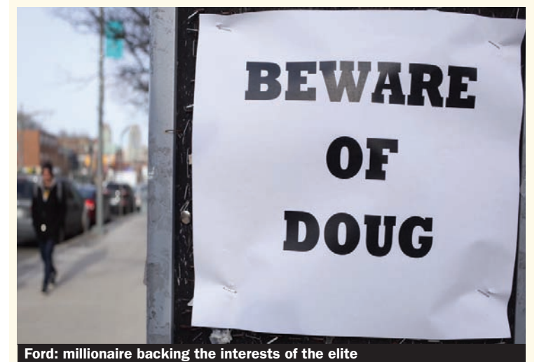
Ford: millionaire backing the interests of the elite