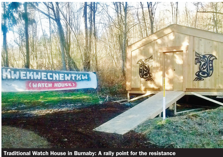
Traditional Watch House in Burnaby: A rally point for the resistance

Whether through court challenges or direct action and campaigning, the resilience of the Indigenous land defenders and their supporters can stop this destructive pipeline project once and for all.