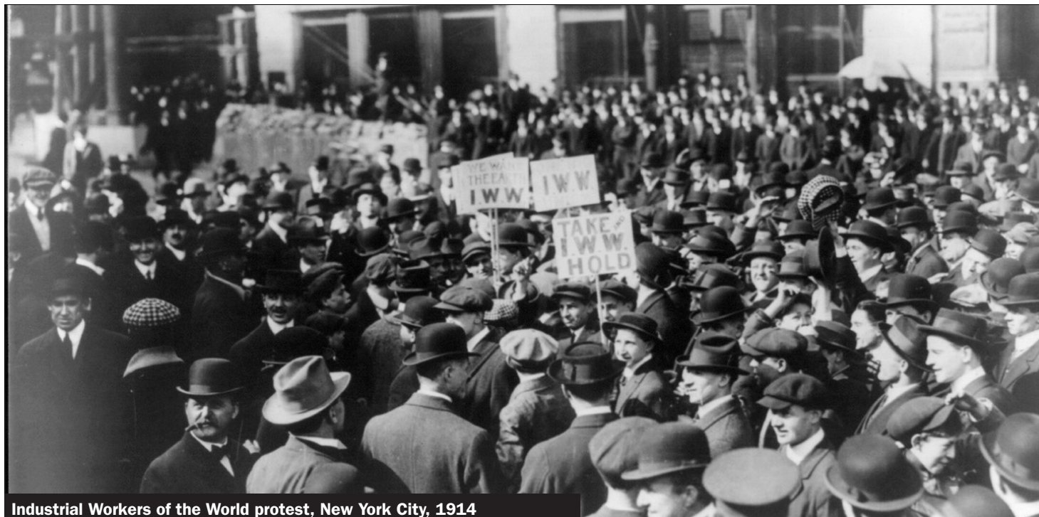
Industrial Workers of the World protest, New York City, 1914