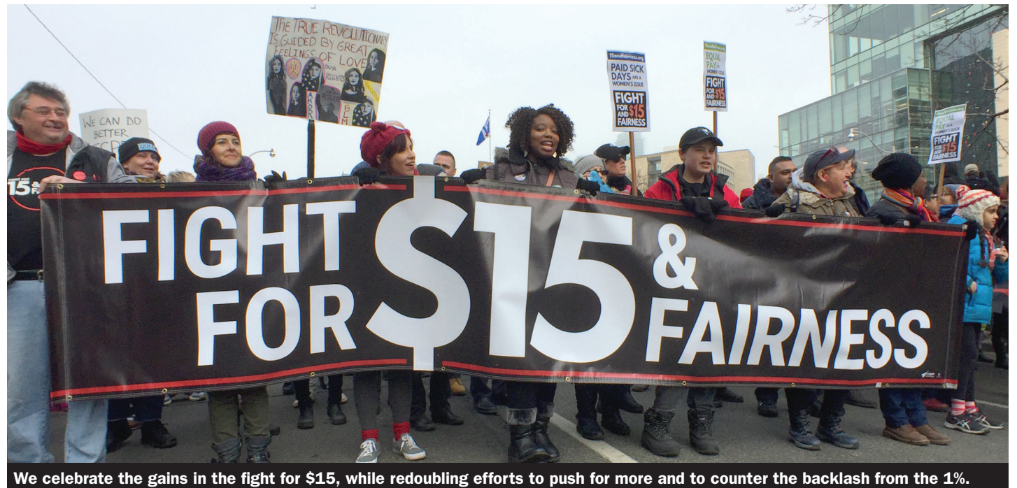
We celebrate the gains in the fight for $15, while redoubling efforts to push for more and to counter the backlash from the 1%.

For example, at the outset of the campaign, the Ontario government firmly stated that the