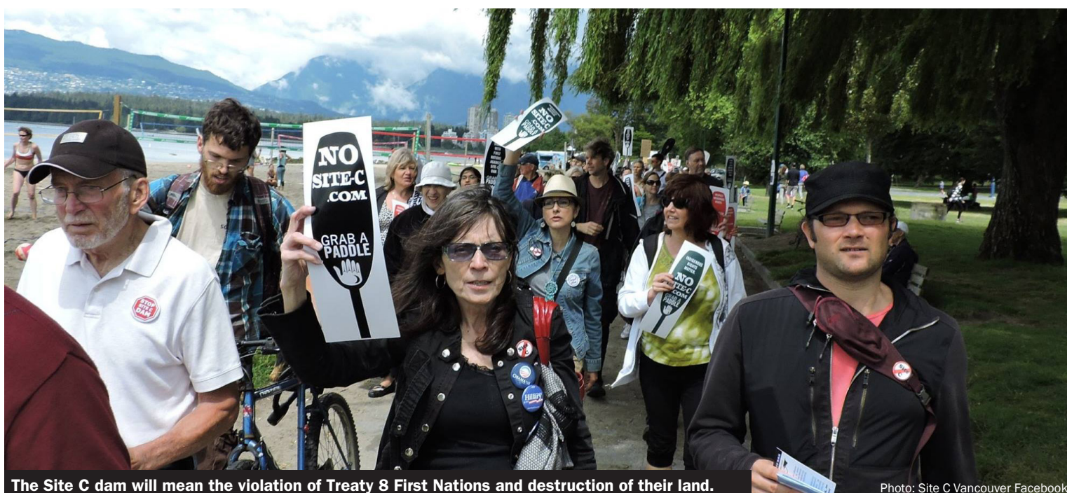
The Site C dam will mean the violation of Treaty 8 First Nations and destruction of their land.

QS has now clearly opted for a true opposition to establishment parties, for politics done “differently”. Manon Massé told the convention: “Together we will see many more Springs.”