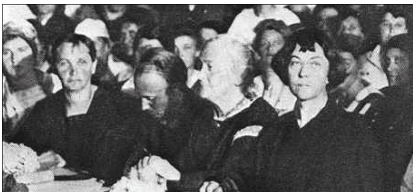
Clara Zetkin (centre) and Alexandra Kollontai (right) at the Comintern

The increased freedoms ushered in by the Russian Revolution—for oppressed nationalities, for racial minorities, including Muslims and Jews, for women, for lesbians and gays—were not an accidental outgrowth of the revolution,