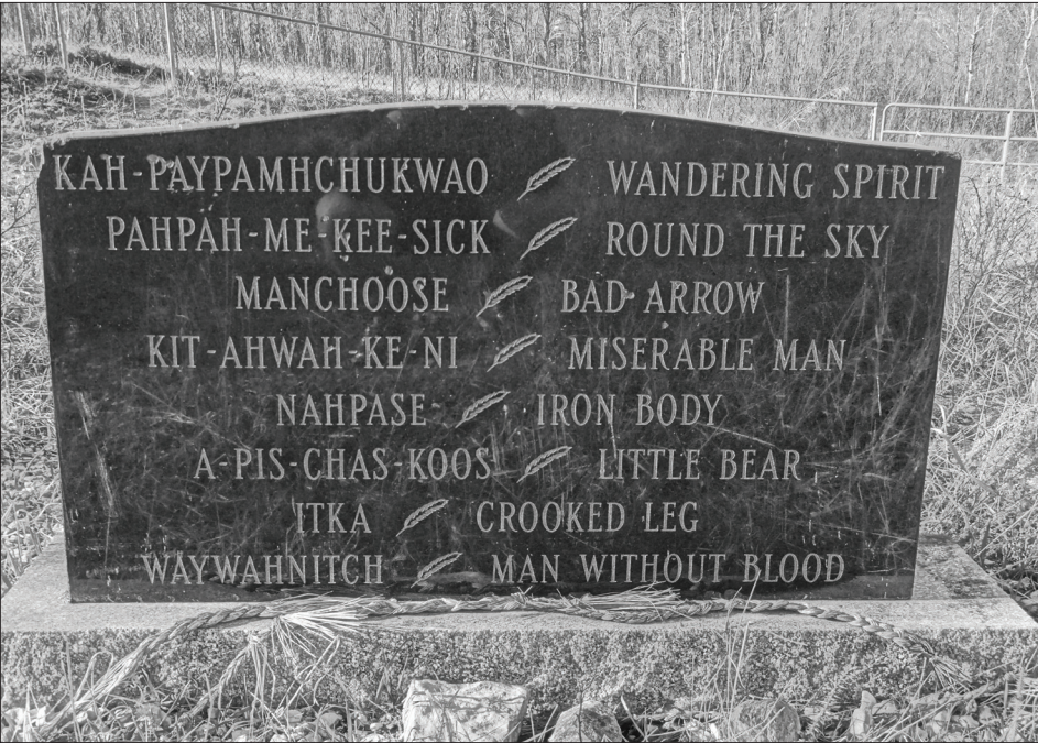
Left: soldiers march down the streets of Montreal during War Measures. Centre: standoff at Oka. Top-right: 1919 Winnipeg General Strike. Bottom-right: grave site of the Battleford Eight, commemorating the victims of Canada’s largest mass hanging.

But since then, they’ve worked to undermine it. When it began, the deal was that the federal government would pay half the costs. But this has fallen to less than a quarter after successive Conservative/Liberal cuts. Harper cut $36 billion from federal health transfers to provinces and it seems like Trudeau is just fine with that.