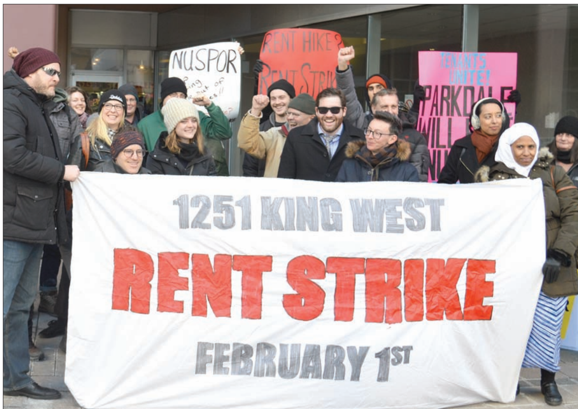
Parkdale residents strike against Nuspor