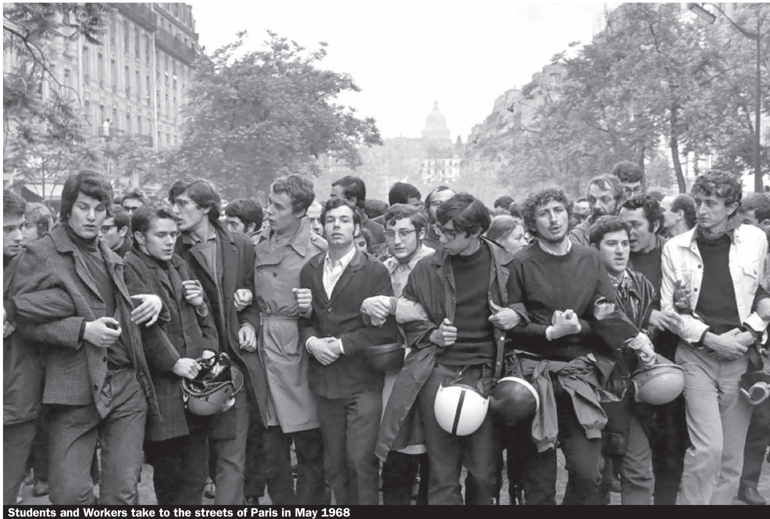
Students and Workers take to the streets of Paris in May 1968

After more than a century of attacks by white racists who always insisted on their ‘constitutional right to carry guns’, here was an organization which proclaimed openly its readiness to fight back.