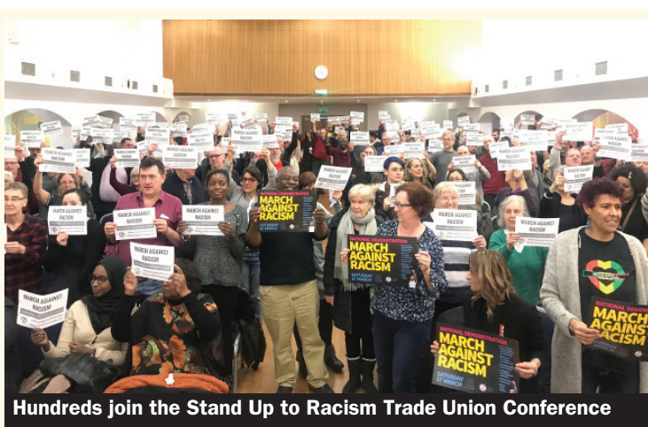
Hundreds join the Stand Up to Racism Trade Union Conference

The conference was extremely useful, showing concrete ways to build the unity necessary in the working class to fight this racist cancer and stop it in its tracks. It has to be taken on directly and not allowed to fester without a mass response. The demonstration of 4,000 that took place a number of months ago in Vancouver shows what is possible. The Toronto and York Region Labour Council, the Urban Alliance on Race Relations and the National Council of Canadian Muslims are planning an event entitled Stop the Hate at Toronto City Hall on March 21st which will bring people together in the fight against the far right. These are the type of events we must continue to organize as we put real alternatives forward so that workers see that another world is actually possible.