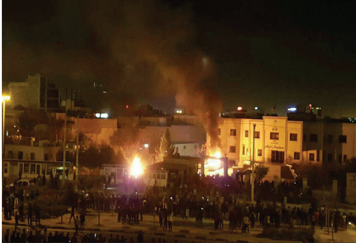
Judiciary building ablaze in Kashar, Iran on January 2.

President Rouhani's budget announcement for 2018 was probably the spark that lit the fire of the pent-up anger of impoverished workers and other layers of people. 40% of the Iranian population is below the poverty line.