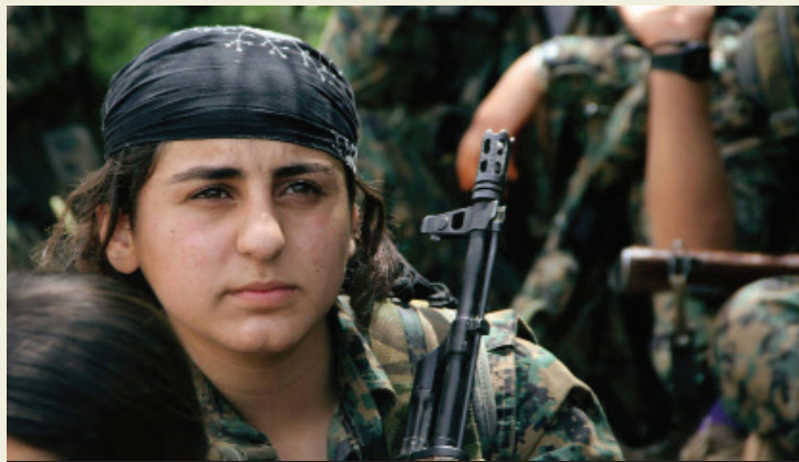
YPG Fighter in Syria.

The other loser is the Turkish president, Recep Tayyip Erdogan. He strongly backed the 2011 revolution and hoped to see Islamists like him take over in Syria. Not only has he totally failed to achieve this objective, but he faces a powerful armed Kurdish presence in northeastern Syria