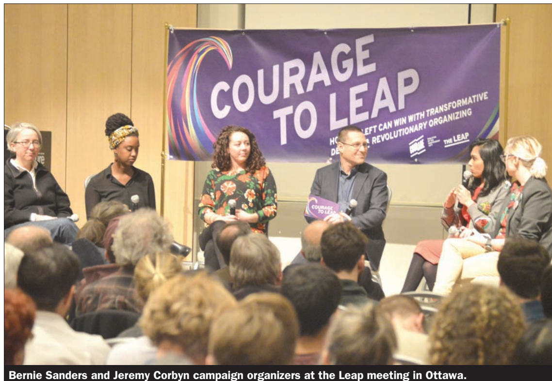
Bernie Sanders and Jeremy Corbyn campaign organizers at the Leap meeting in Ottawa.