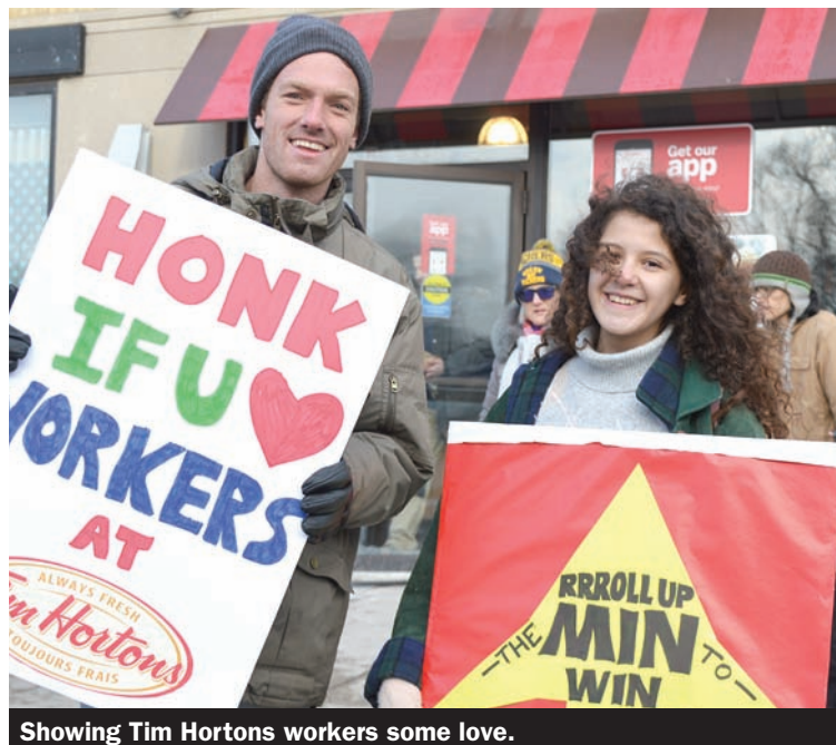
Showing Tim Hortons workers some love.

Since January, many Tim Horton's franchises have been exposed for cutting benefits and perks, taking away paid breaks and generally trying to punish workers for the increased