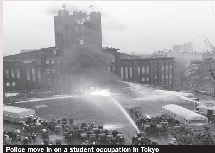
Police move in on a student occupation in Tokyo

Its attempt to purge communist faculty was met with heavy resistance from the students with large-scale protests, and the momentum prevented the government from passing legislation to allow the police into Universities. The Japan