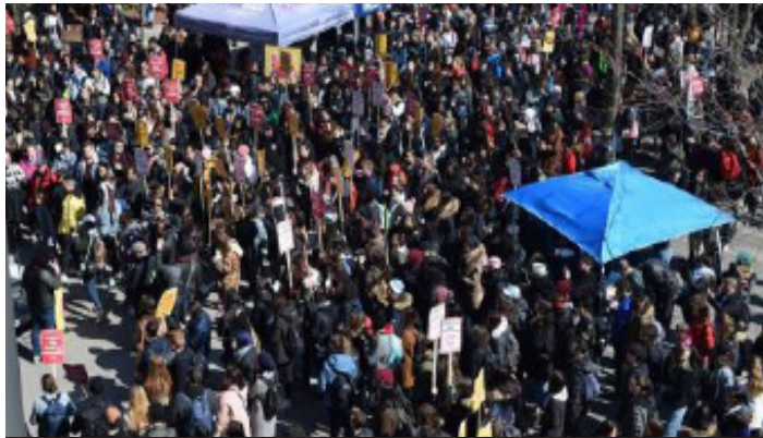
Student walkout against Ford

the possibility of labour/community solidarity when postal workers, members of CUPW, were ordered off their strike by Trudeau. Trade unionists and community members