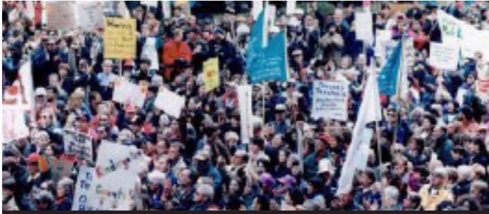
Rally against Harris cuts in 1997