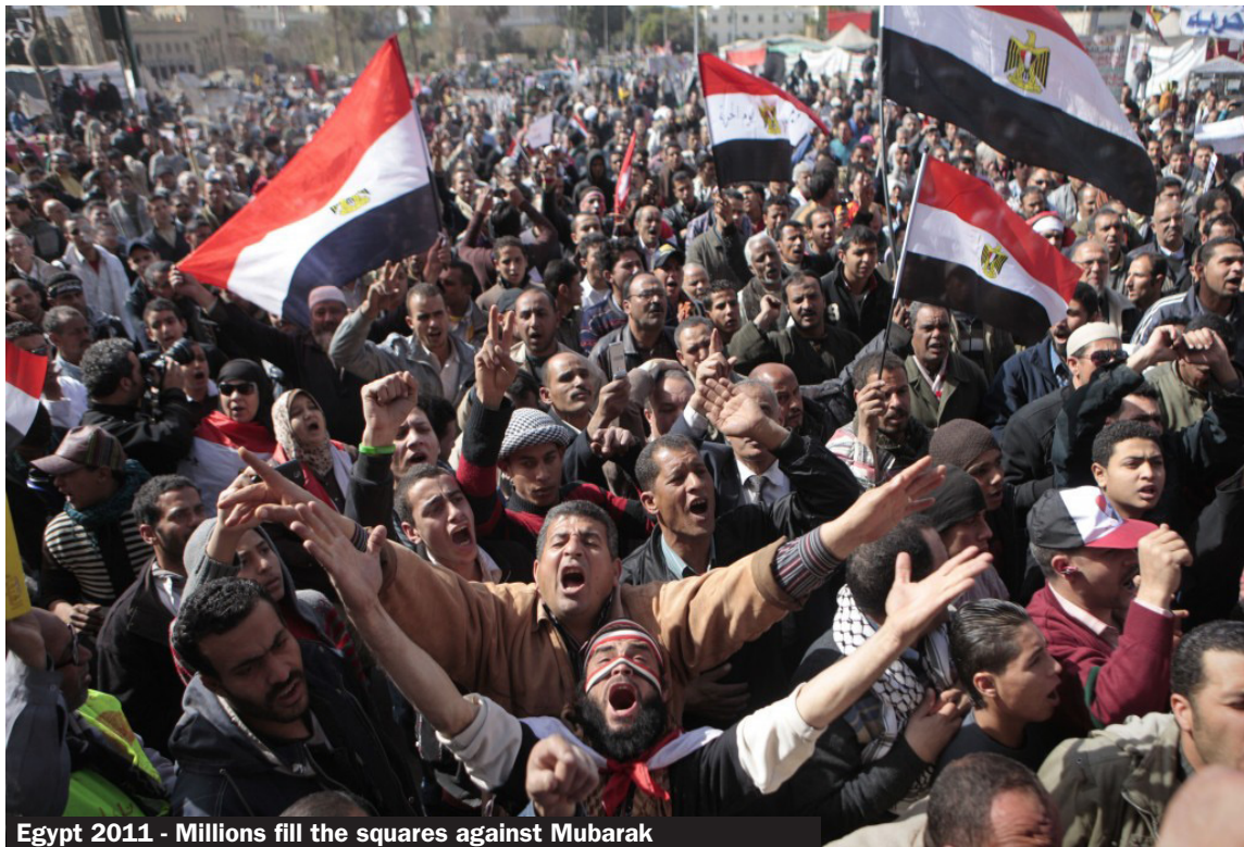
Egypt 2011 - Millions fill the squares against Mubarak

The Russian Empire was referred to as "the prison house of nations," by revolutionaries. These nations were able to use the new government as a force for national liberation. Local governments were set up in the local language. Religious artifacts that had been stole by the Empire were returned to Mosques.