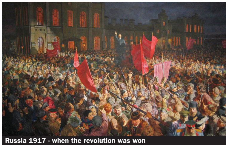
Russia 1917 - when the revolution was won

Elise Reclus, summed up the meaning of the Commune, "The Commune set up for the future a new society in which there are no masters by birth title or wealth, and no slaves by origin, caste or salary. Everywhere the word "Commune" was understood in its largest sense as referring to a new humanity, made up of free and equal companions, oblivious to the existence of old boundaries, helping each other in peace from one end of the world to the other." Quoted in Genderquake: socialist women and the Paris Commune isj.org.uk/genderquake-paris-commune/