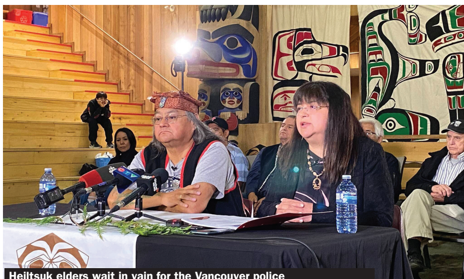
Heiltsuk elders wait in vain for the Vancouver police

In late October a ceremony of cleansing and apology was