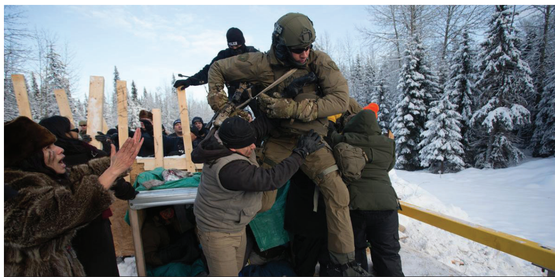
Militarized RCMP units violently attack Wet’suwet’en Land Defenders

Every assertion of Indigenous sovereignty against the Canadian settler colonial project and every strike by workers contains the seed of revolution. Building solidarity for these struggles and the connections between them is the urgent task of socialists in so-called Canada today.