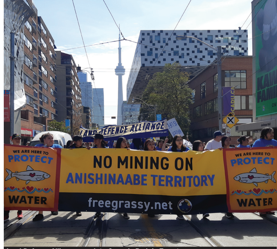
Land Defence Alliance march to Queen's Park in Toronto

the James Bay lowlands, one of the world's largest untapped sources of nickel, copper and cobalt— minerals essential for batteries that power electric vehicles. Having signed deals with automakers Volkswagen and Stellantis