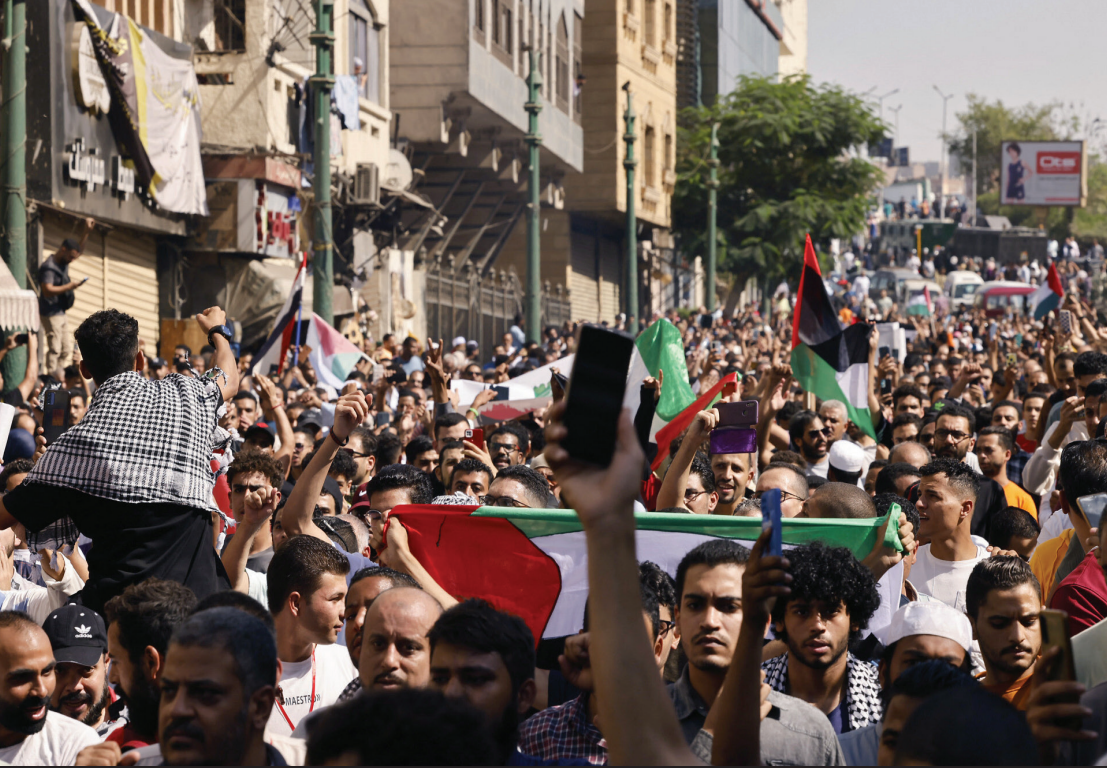
The road to Jerusalem runs through Cairo - Thousands take to the streets in Egypt

Zionism as antisemitism, as well as the efforts, especially in Europe, to criminalise solidarity with Palestine. In some countries, the escalation and the growing solidarity movement with Palestine are accompanied by a new wave of repression and anti-Muslim racism. We oppose the bans on demonstrations