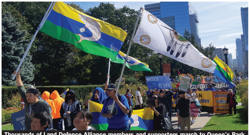
Thousands of Land Defence Alliance members and supporters march to Queen's Park

As always, the government and corporations portray Indigenous communities as supporting all the development, but experience teaches us that it is not so easy.