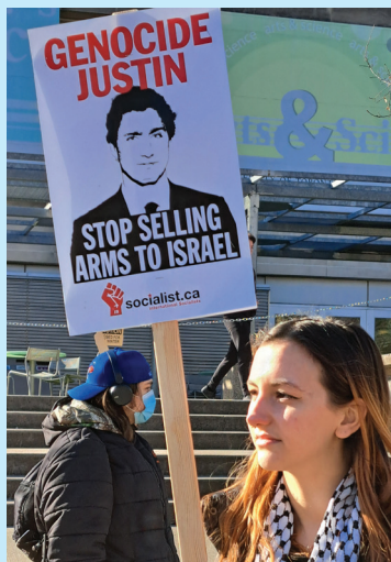
University of Toronto students walk out to protest Genocide Justin and UofT complicity

The ICJ ruling is a major victory for Palestinians and their millions of supporters around the