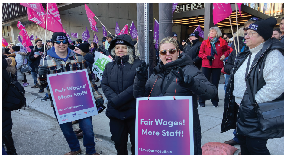
Workers mobilize to save public healthcare in Toronto