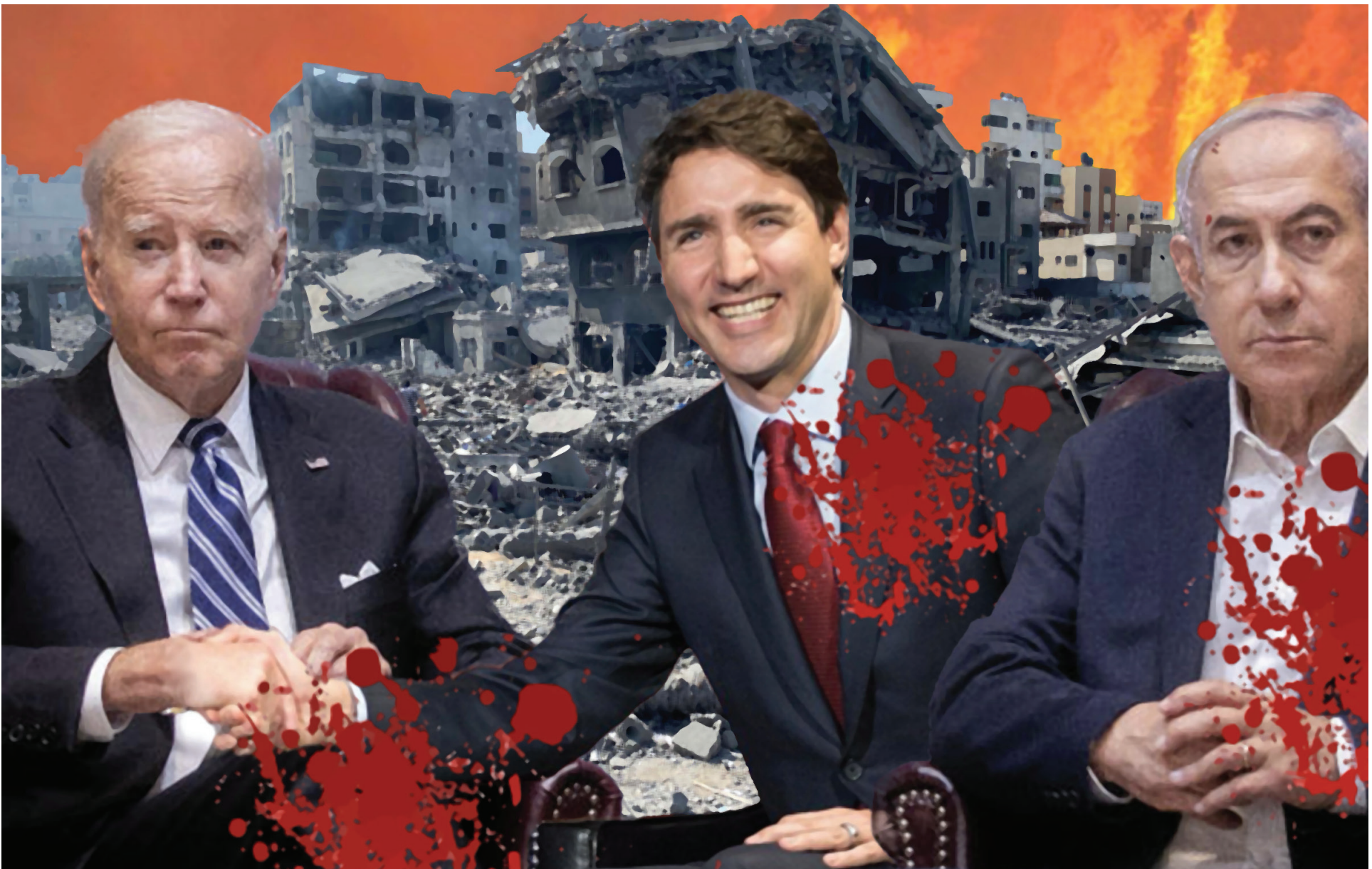
Blood on his hands: Trudeau has admitted that Canada sold new weapons to Israel since the genocide on Gaza began. The Liberals have also lined up with the US and others to cut UNRWA funding which will kill innocent people in Gaza. Read more about the fight for a free Palestine on pages 4,5,6