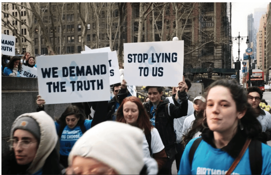
Jewish American protest the AIPAC meetings