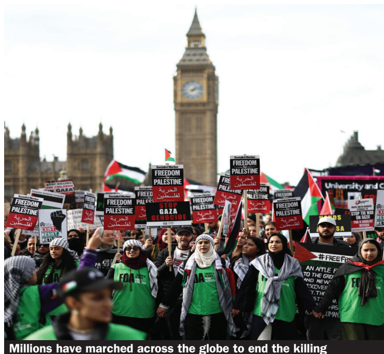
Millions have marched across the globe to end the killing

All countries that signed the convention are obligated to "prevent and punish" genocide. However, there is no enforcement mechanism at the International Court of Justice. The global movement in solidarity with Palestine is the only enforcement mechanism. We need a global movement that moves to strikes and walk-outs and targets the only thing that our rulers hold dear: profits. Only when our rulers are more afraid of losing control in their own countries than they are afraid of losing control in the Middle East will we see an end to this genocide. It's only when we finally overthrow capitalism that we will be able to end the wars, violence, and genocide that it creates.