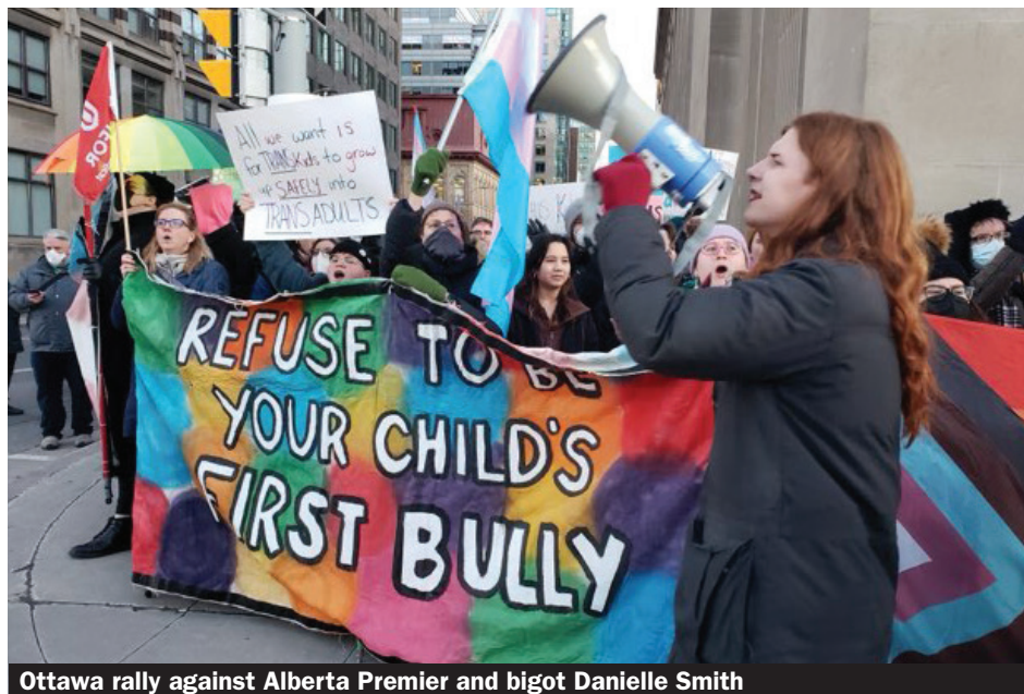
Ottawa rally against Alberta Premier and bigot Danielle Smith

There has been a response to these attacks, with sizable demonstrations happening across the province after the announcement. LGBTQ advocacy groups are preparing legal challenges to the new rules. Even mainstream politicians like Justin Trudeau have denounced the move, but Smith has not ruled out using the ‘notwithstanding clause’ in the Charter of Rights to escape any legal challenges to her bigotry. The only way forward is to continue to build the movement to defend trans rights in Alberta, and everywhere else that trans rights are under attack.