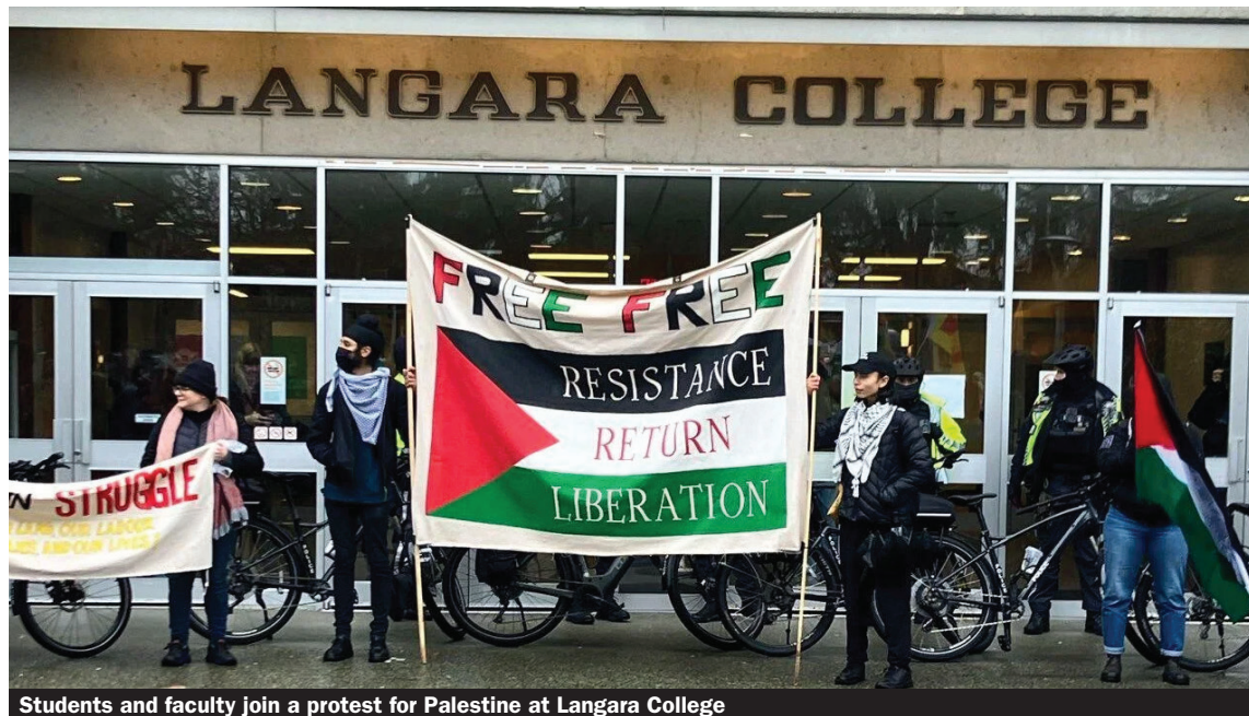
Students and faculty join a protest for Palestine at Langara College