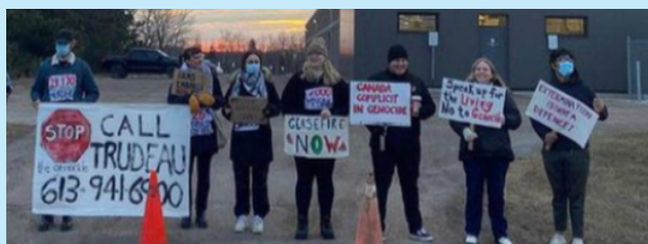
Peterborough blockade Safran Electronics

There are numerous companies in Canada that are involved in the business of genocide. The biggest company invested in the genocide of Palestinians