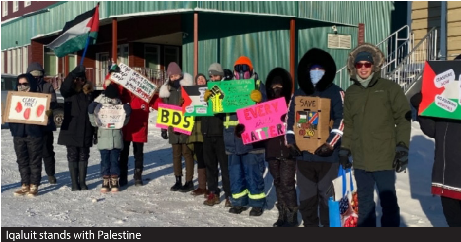
Iqaluit stands with Palestine

his land. This isn't unusual. Land defenders, strikers and protesters have been arrested many times in the past. But the context is different. As the convoy protests taught us, the police are already wedded to the politics of the far-right. These new protest events are another chance for them to attack those they oppose, but to do so under the guise of protecting human rights of Zionists. The question of Palestine is sharpening the contradictions in our society. While millions protest the genocide on the streets, the ruling class tightens its grip on power with ever more repression. As the many crises of capitalism worsen, we will need organized forces to both mitigate the worst of the impacts of those crises and to defend those standing up for human rights and the planet. It's time to get organized.