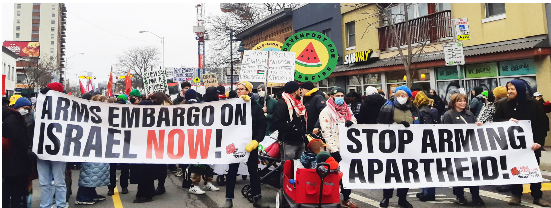
Toronto community rally marched to two MP offices to demand an end to arms sales to Israel

A s of March 4, more than 30,000 Palestinians have been killed in the relentless bombardment of Gaza. That includes some 13,400 children in one of the worst textbook cases of genocide the world has seen.