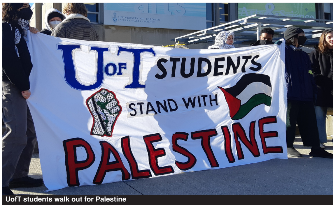
UofT students walk out for Palestine

For example, after the 1967 war, there was a Canada Park that was built in the West Bank. This is one of the most disgusting things, where 15 million dollars were sourced from Canadians to create a national park on land that was once occupied by Palestinians, for recreational enjoyment of the settlers. But this is just one example.