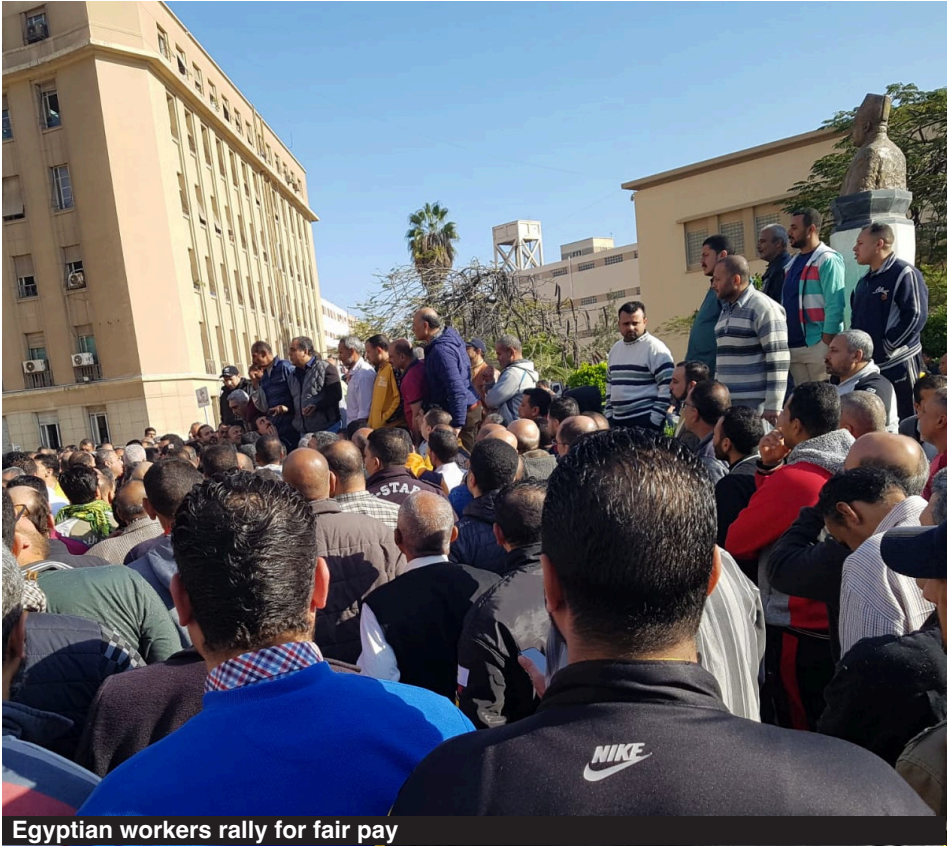
Egyptian workers rally for fair pay

B osses are trying to smash a strike by thousands of workers in Egypt's biggest textile factory in Mahalla al-Kubra by blocking payment for work they have already done. But the strikers were standing firm and refusing to give in. The strike began among women workers and then spread to involve large sections of male workers at the company that employs 14,000 people. Workers receive their salaries starting on the 25th of each month. But management has withheld the pay workers are owed from before they struck. One worker said, "Instead of responding to our legitimate requests, the company deprives us of our salaries and uses the weapon of starvation as if we were in Gaza." He added, "A state of extreme dissatisfaction prevails among the workers due to their desperate need for money, especially with the approaching month of Ramadan." "Our battle is the battle of all those working in the business sector, and we can only win if other companies join us, as the oil company did in Assiut." Workers at the oils and detergents company in the city of Assiut are striking for the same pay rise as the Mahalla workers. Egypt's repressive president Abdul Fattah al-Sisi recently announced a rise in the minimum wage for state workers to 6,000 Egyptian pounds—£150—a month. Many workers are paid less than this and are demanding they receive at least this pay. About 400 temporary workers at Assiut