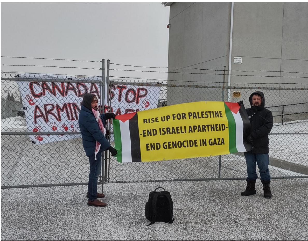
Activists shut down Raytheon in Calgary

Another example, Canadian Highways Infrastructure Corporation was the lead organization that created the private consortium which spent 3 billion dollars in creating a settler-only apartheid highway.