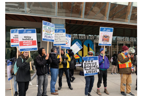
Holding the line!