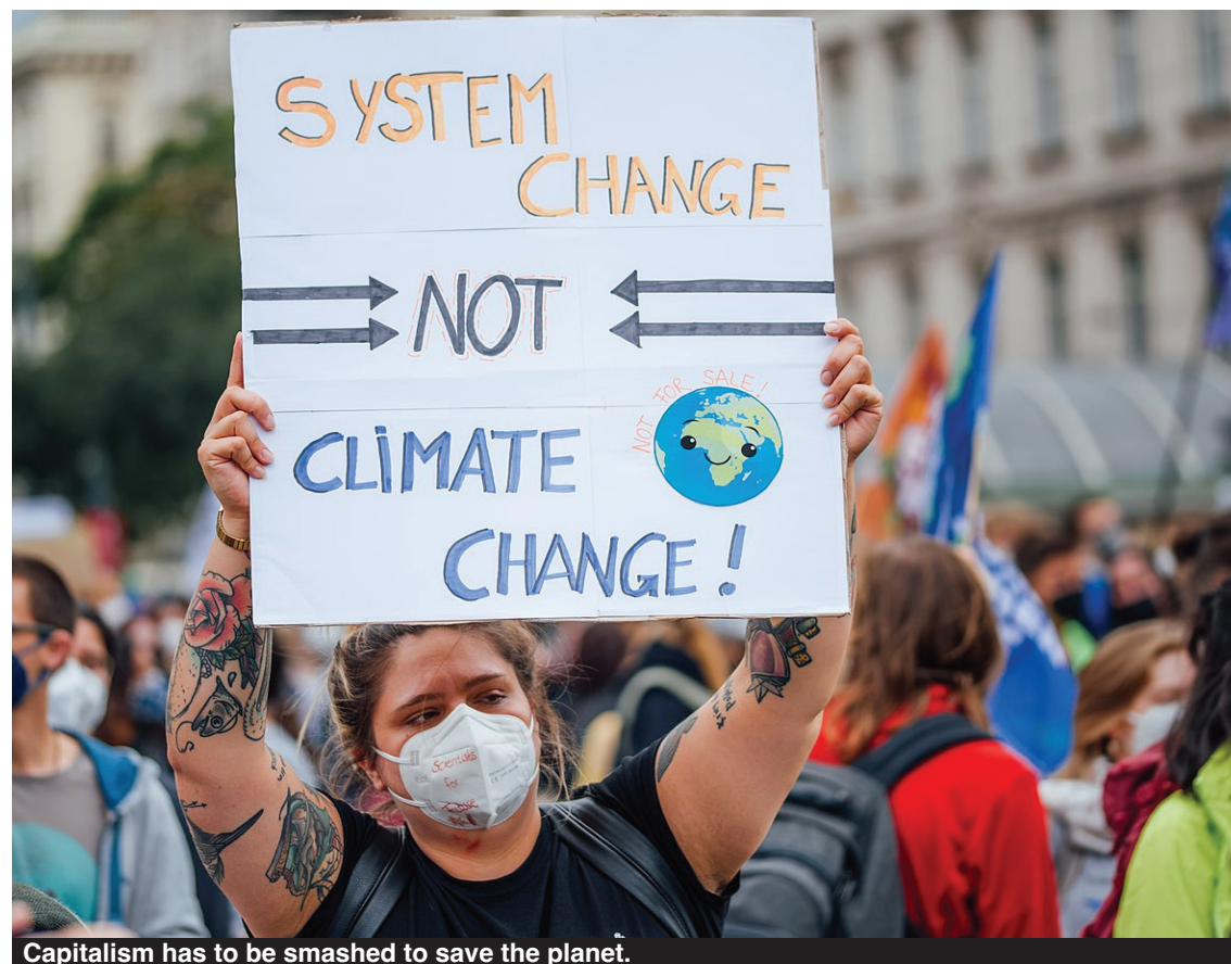
Capitalism has to be smashed to save the planet.

There is hope. It is in a resurgence of movements for climate justice from below that can bring together Indigenous sovereignty struggles, grassroots environmental movements and continuing strikes by workers against inflation. This mass movement can challenge the bosses who would rather burn the planet than give up their oil and blood soaked profit.