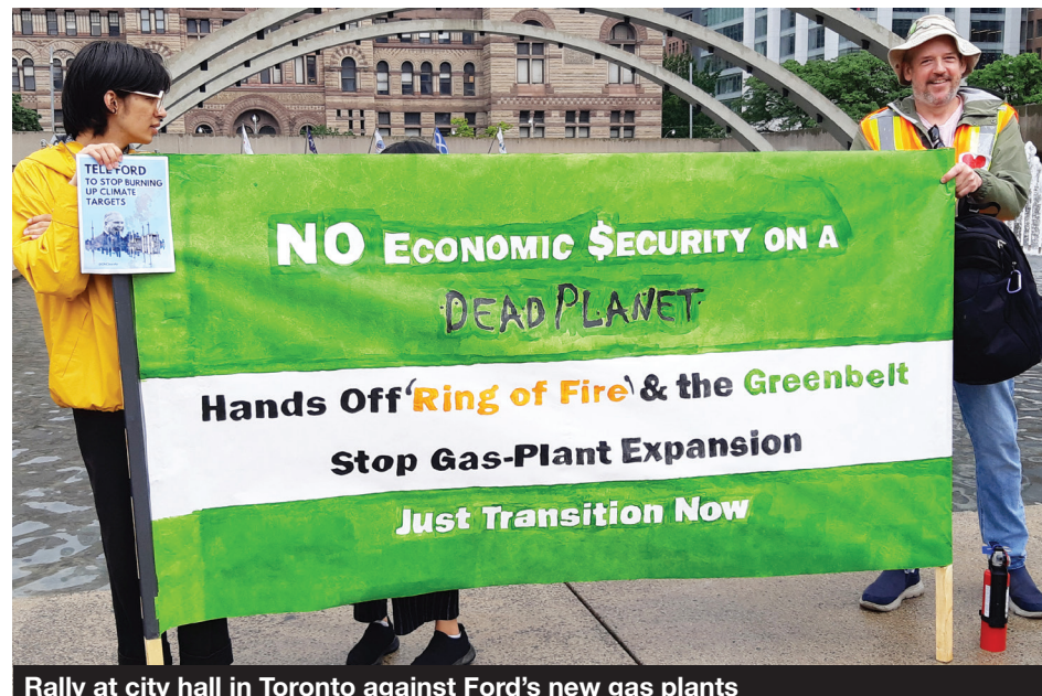
Rally at city hall in Toronto against Ford's new gas plants