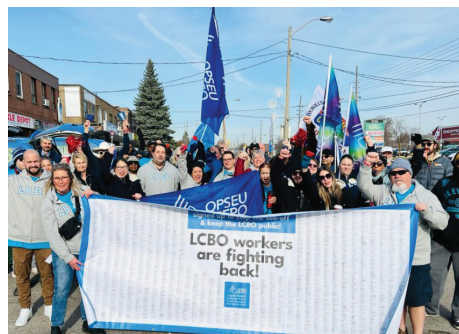
Ford is in for a fight.

LCBO workers are fighting to keep those revenues invested in public services and to fight for good jobs. Public sector workers can stop Ford in his tracks, as the CUPE education workers did when they struck illegally and won. These workers deserve our support and solidarity as they ramp up this struggle.