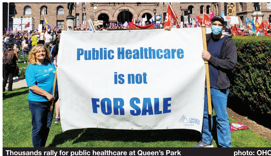
Thousands rally for public healthcare at Queen's Park

We know Ford and the Tories won't voluntarily end their attacks on public healthcare. But they can be stopped when healthcare workers and people who depend on healthcare unite.