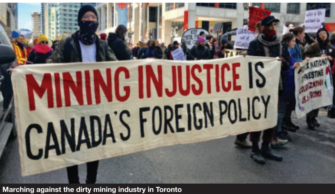
Marching against the dirty mining industry in Toronto

The brutality revealed by Canada's role in propping up Israel's genocidal war against Palestine has opened many eyes. The pursuit of power and profit revealed in the scramble for Africa is different only in scale. It is time to get rid of double-talk about "Canadian Values" and recognize the only values motivating our government are those that motivate the corporations it serves: profit and greed.