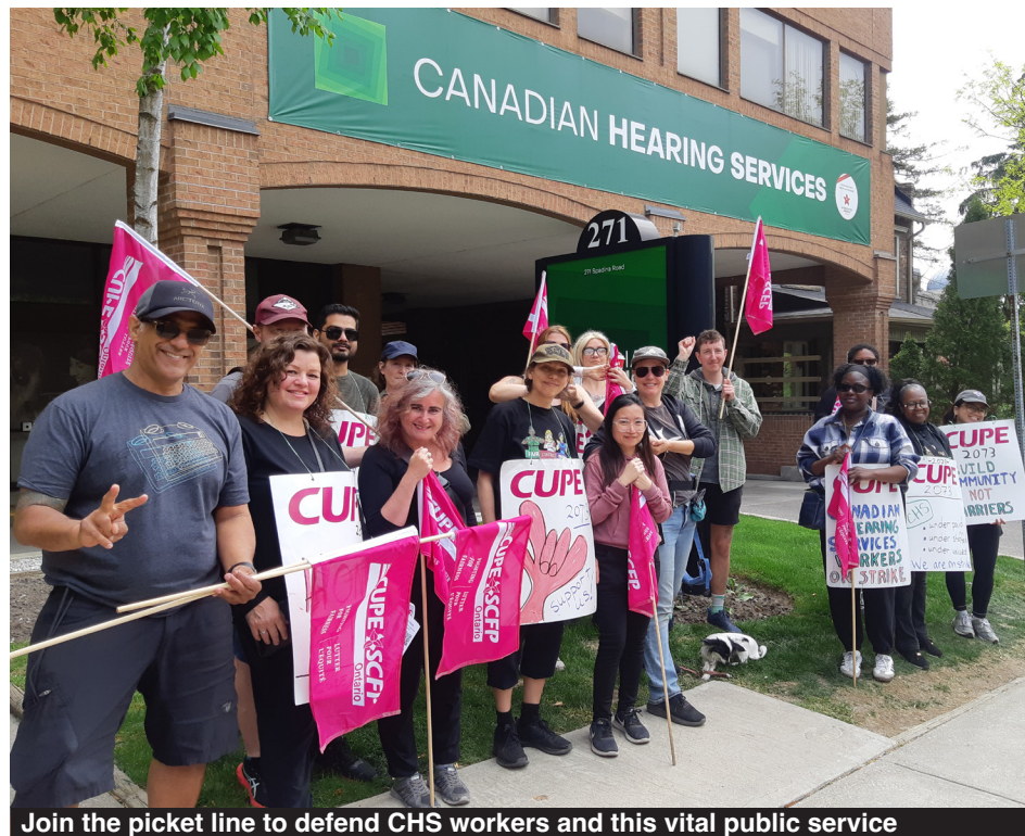
Join the picket line to defend CHS workers and this vital public service

are a crucial part of a unique and distinct culture, language and community. "There is only one organization that provides this service and it is at risk because of mismanagement."