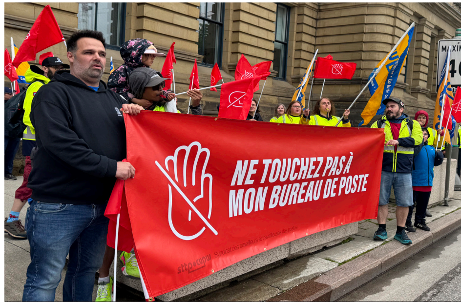
Postal workers rally at Mark Carney's office in Ottawa

Postal workers say this fight is far from over. The labour movement needs to build solidarity wherever it may be needed and to be ready to escalate to protect workers' rights and a vital public service. This fight could leverage the strong support for home delivery, but that can't be left to CUPW alone.